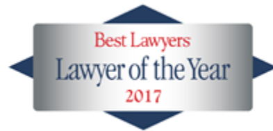
Criminal Defense: White-Collar – Seattle, WA